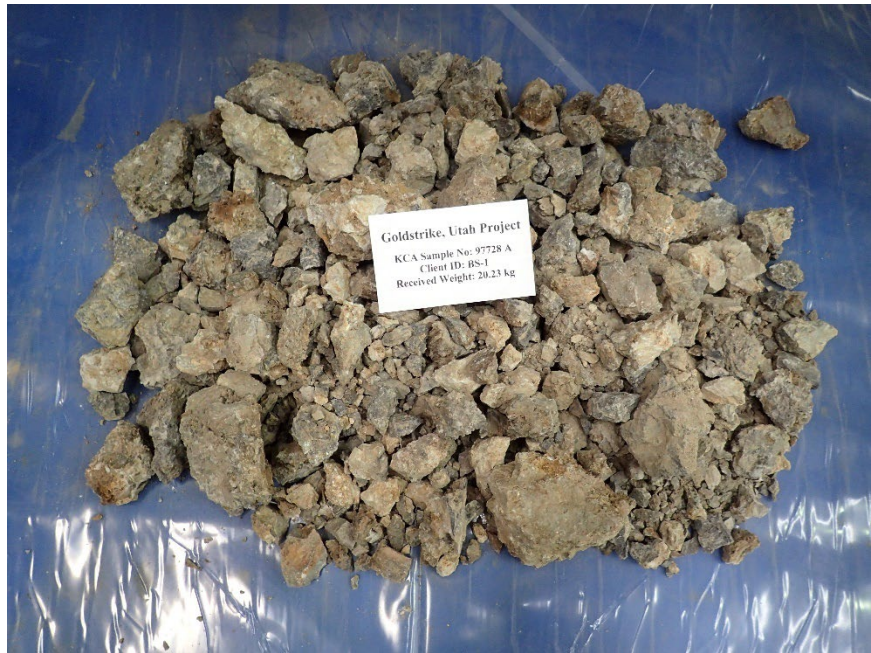
Figure 2-1. Goldstrike, Utah Project BS-1 KCA Sample No. 97728 A Photograph of Received Material